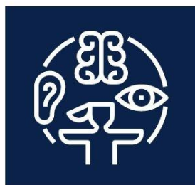
NEW SENSORY SPACE