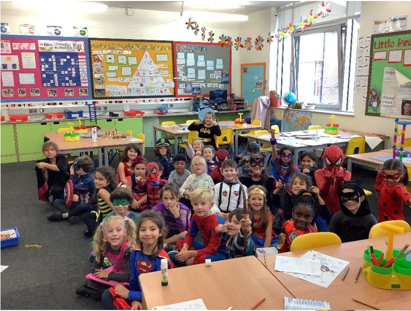
Superhero Day !!!