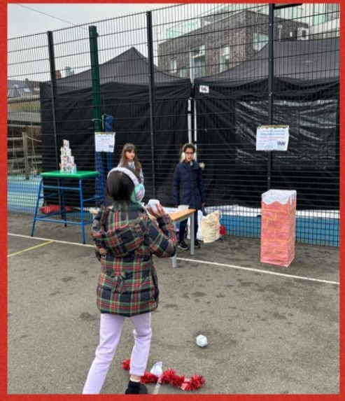
Well done to our School Council who raise over £270 at the Christmas Fair!