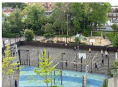
Doing the laps during clubs!