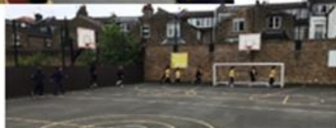
Well done to Year 1 who have been doing running every day!!