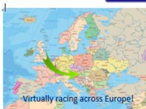
Virtually racing across Europe!