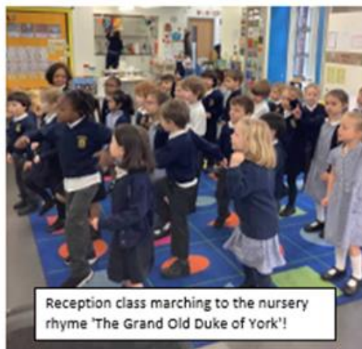
Reception class marching to the nursery rhyme 'The Grand Old Duke of York'!

Good luck and keep active. Every kilometre counts! Please help us raise money for GOSH and Golden Time games!