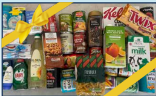
A well balanced 3-day emergency parcel for 1 person could mirror the photo above. (Cost per package may vary according to availability*).

EVERY £40 RECEIVED IN CASH DONATIONS PAYS FOR ONE EMERGENCY PACKAGE*