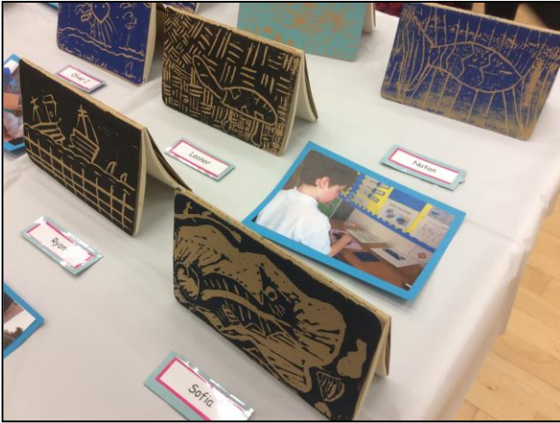
Some of the fantastic work that was on display!