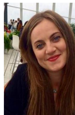
Miss Prodromiti LSA in Emerald & Quartz