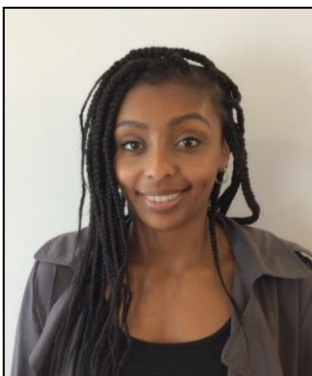
Miss Solomon LSA in Amber & Sapphire