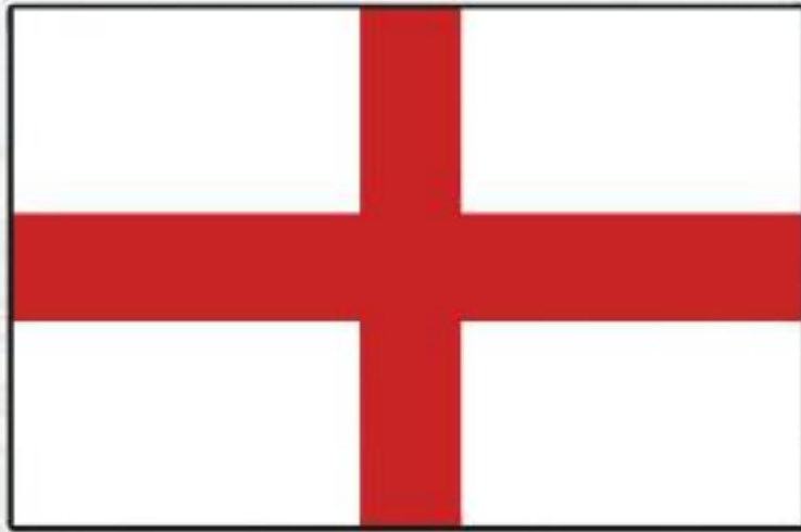
This is the flag of Saint George

The flag of Saint George makes up the English part of the Union Flag.